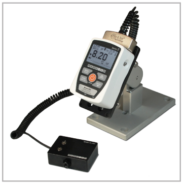
3i is shown mounted to an optional AC1008 tabletop stand with Series R03 force sensor