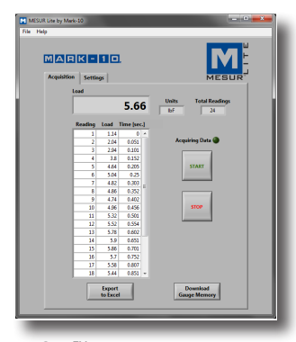
MESUR™ Lite data acquisition software is included with the 3i

The gauges include MESUR™ Lite data acquisition software. MESUR™ Lite tabulates continuous or single point data. One-click export to Excel allows for further data manipulation.