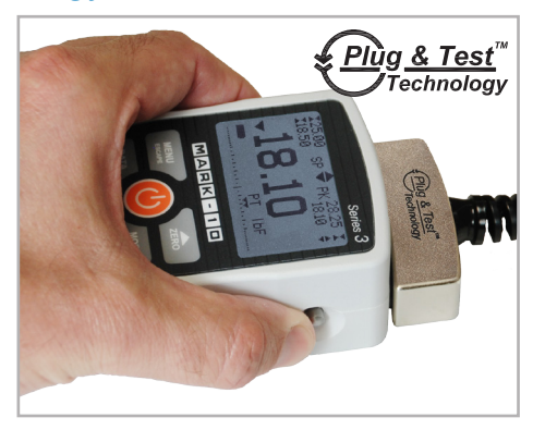
^ The Plug & Test™ connector locks into the receptacle in the indicator when fully inserted. Dual buttons on the indicator housing release the connector for easy removal. Gold plated spring contacts ensure long lasting and reliable connection.