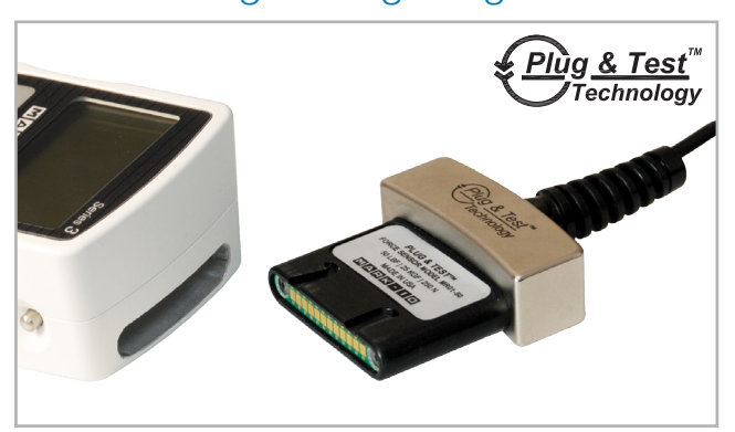
^ Unique Plug & Test™ technology allows for interchangeable sensors to be used with a Mark-10 model 7i, 5i, or 3i indicator. All calibration and configuration data is saved in the smart connector.